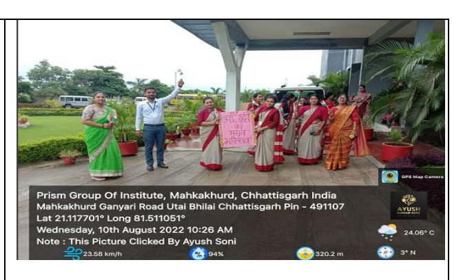
Azadi ka Amrit Mahotsav