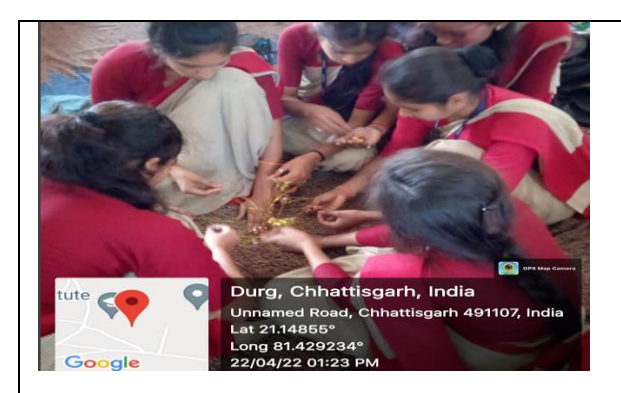
Value added course