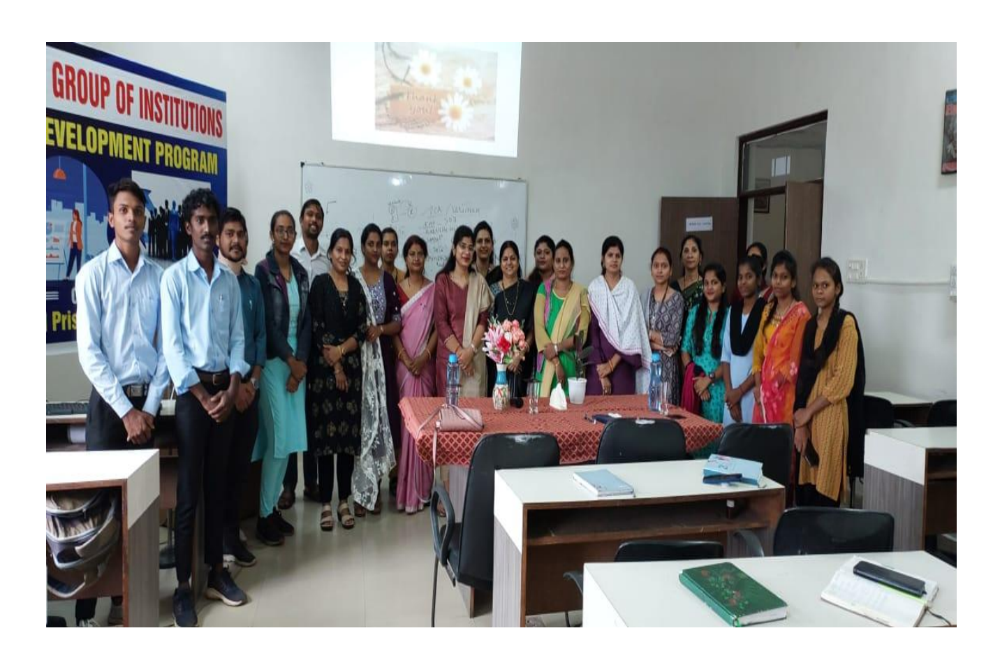
FACULTY DEVELOPMENT PROGRAMME on RESEARCH ENHANCEMENT (Youtube Link)

https://www.youtube.com/watch?v=Yy4qBzXLFzI